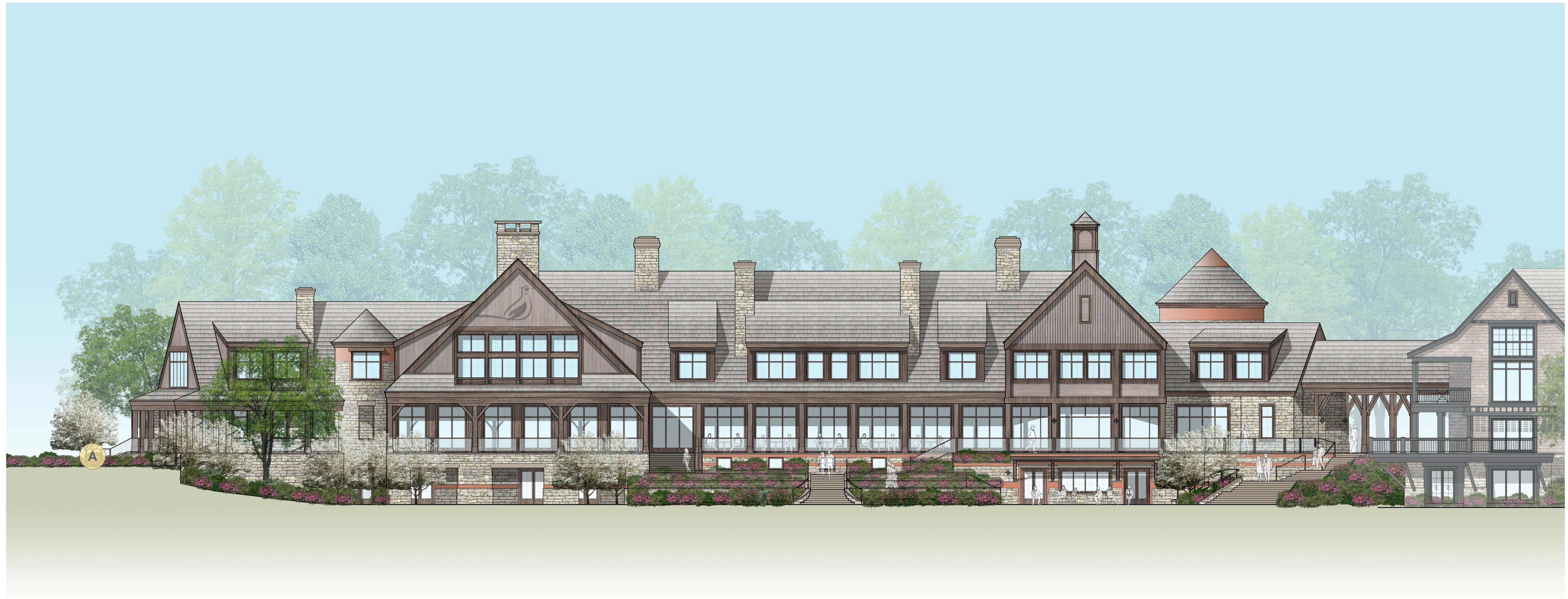
ELEVATION KEY PLAN (NOT TO SCALE)